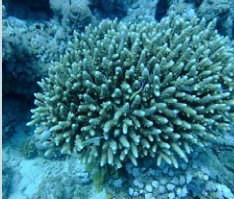
Figure 1. Acropora spp., once thought impossible to propagate, are now one of the most common artificially grown corals.

Everybody knows corals are colourful and beautiful, and most know that coral reefs are the most biodiverse of all marine environments. It is no surprise therefore that the general public would want a piece of paradise in their own home. Due to their increasing popularity, saltwater aquariums that contain living corals have dramatically increased in popularity since the late 1980s. Coincidentally, the global trade of live stony coral has increased 20 fold from 1985 to 1995 and is still increasing. Interest in keeping attractive marine species has been fuelled by popular cultural icons like Nemo, advances in aquarium technology making it easier to manage marine species, and the explosion of online retailers selling marine livestock.